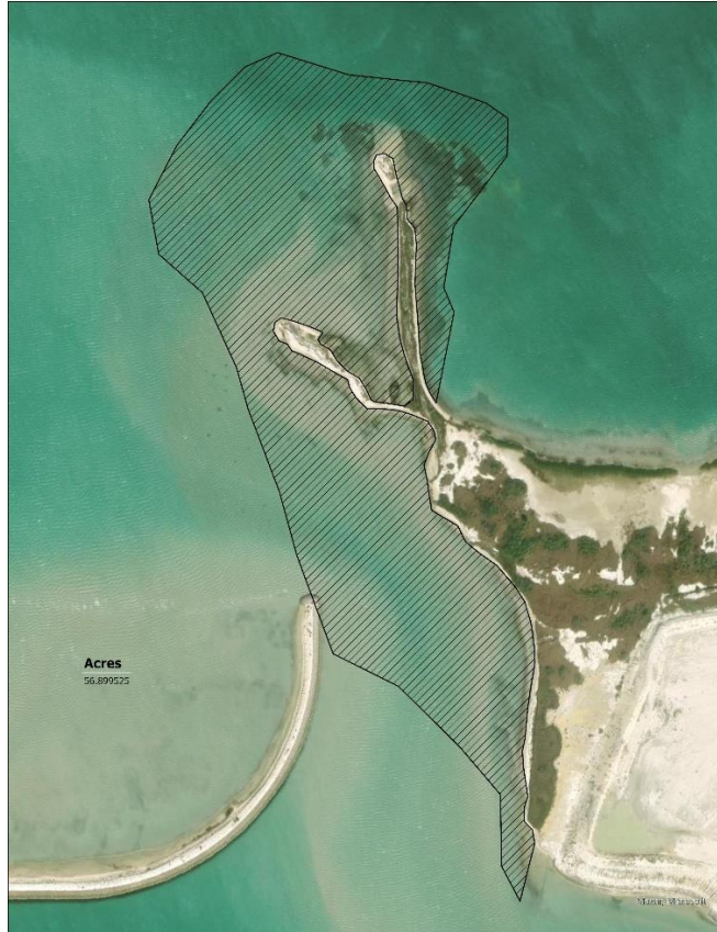
Figure 1: Task 1 Survey Location